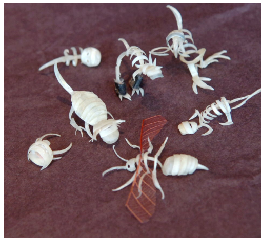
I don't know if I should feel in awe, or disgusted?