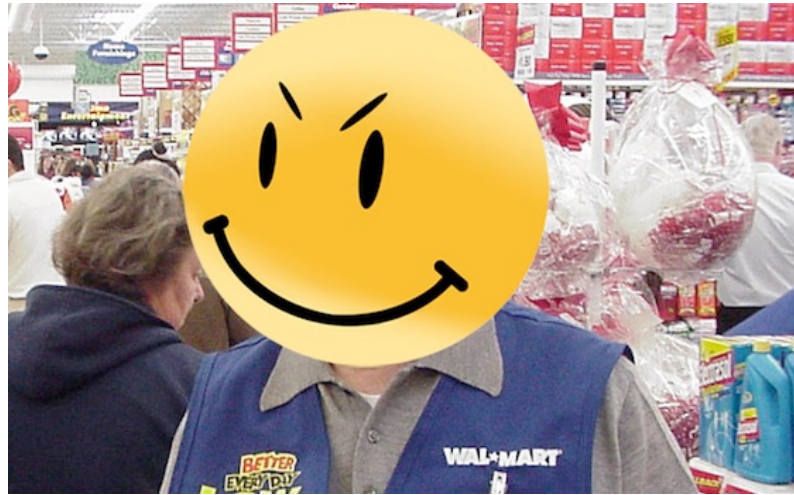
Official uniform of Wal-mart military members. Rather terrifying, and cheery at the same time...

The President released a statement late Sunday evening expressing hope